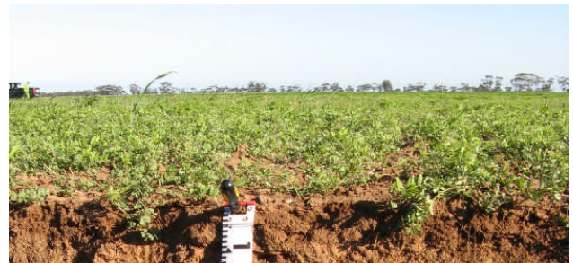
Figure 2: BCG Farming Systems, Fuel Burner paddock, LWA 20 (above) and the No Till paddock, LWA 21 (below), June 2007

The region is part of the North Western Dunefields and Plains. The landscape is relatively simple, consisting of plains on which there are scattered low hummocks. There is a relatively narrow range of soils in this landscape; gilgaied light clays are the most widespread soils, occupying the plains. Lighter soils of sandy loams predominate on the slopes of the hummocks.