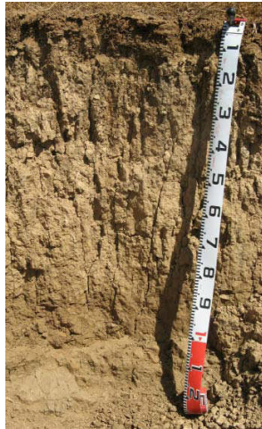
Figure 3: Soil Profile LWA 20

The first soil pit described (Figure 3) is in a cultivation paddock. The surface is a brown light clay that is not saline and is strongly alkaline. The subsoil is a brown light-medium clay with black mottles grading to brown medium clay to 100 cm, below which is a light olive brown medium-heavy clay with olive grey mottles. The subsoil is very strongly alkaline. The surface soil is sodic becoming strongly sodic with depth but that may not disperse due to the high level of soluble salts. The soil is moderately calcareous to highly calcareous throughout the profile with fine earth carbonates. Below 32 cm, soft carbonate segregations are common. Salinity levels increase to a high level below 32 cm. Boron levels are toxic in the subsoil which will affect the growth of boron sensitive species.