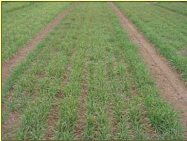
Gairdner barley 200 plants/m 2