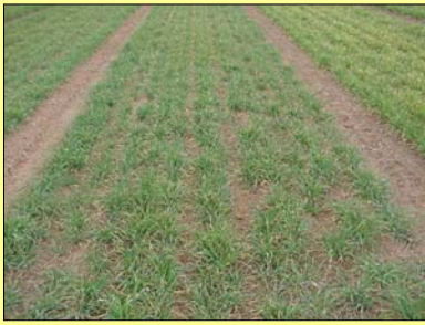
Gairdner barley 100 plants/m 2